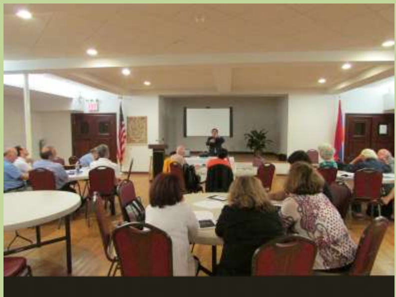
Second session of the seminar