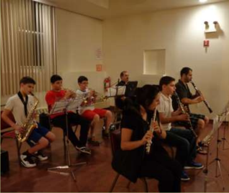
“Hayer” Band during the rehearsal